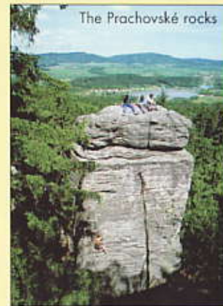
The Prachovské rocks

network of museums records the craftsmanship of people living in this region. The glass product from Železný Brod, Bohemian crystal from Sobotka, biscuits from Lomnice and garnet jewellery from Turnov are well-known even nowadays all over the world. These natural and historical points of interest, together with a rich range of cultural and sports events such as Jičín - the Fairy-tale Town, Šrámek's Sobotka, Old Bohemian Fair in Turnov and Music Summer in Lomnice, offer a wide selection of possibilities to spend an active holiday in one of the most beautiful parts of the Czech land.