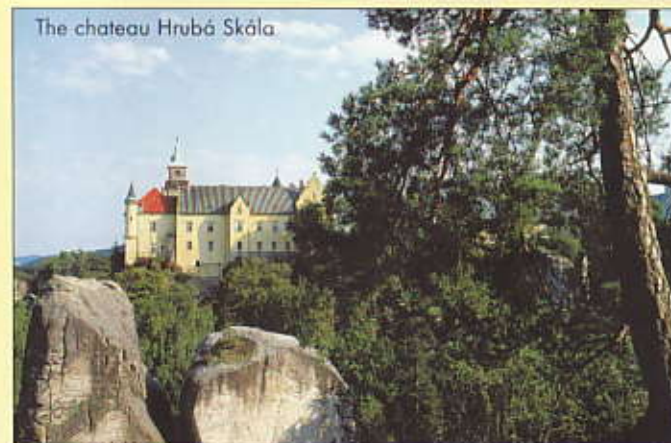
The chateau Hrubá Skála