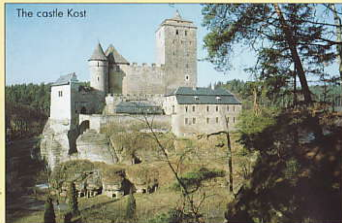
The castle Kost

Mnichovo Hradiště and Hrubá Skála. This is completed by folk architecture - Dolánky u Turnova, Příšovice, Vesec u Sobotky, Sobotka, Železný Brod, Lomnice n. Popelkou and Osek. A rich