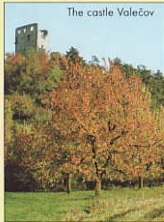
The castle Valečov

of the landscape, there are historical monuments represented by medieval castles - Valečov, Valdštejn, Frýdštejn, Rotštejn, Kost and Trosky, mansions - Hrubý Rohozed, Sychrov, Humprecht,