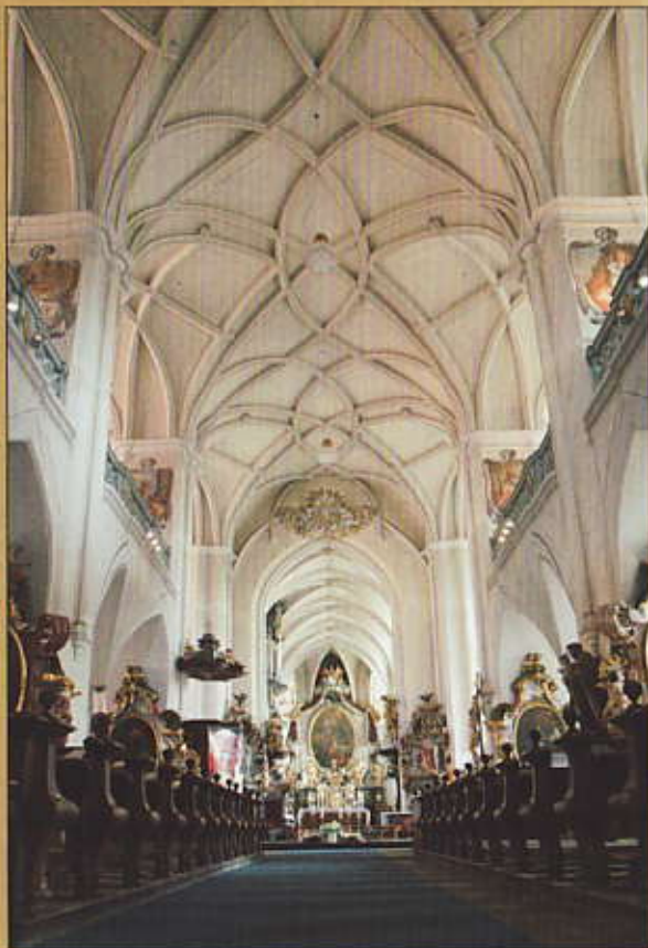
8.2. The Vaulted Hall