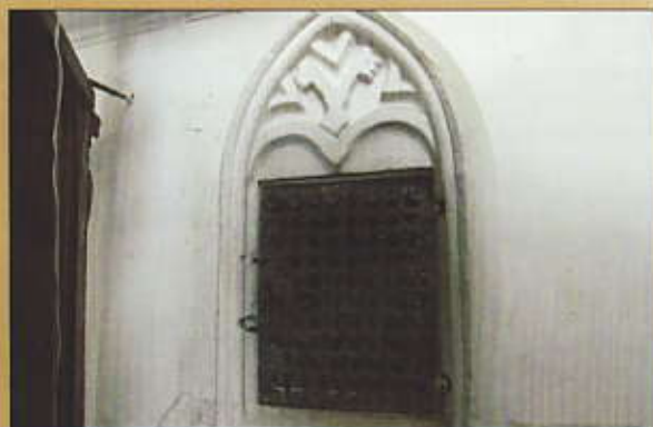
8.1. Presbytery (Gothic Chancel)